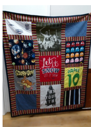
Members busy at our Two Corners Evening Show and Tell By Members